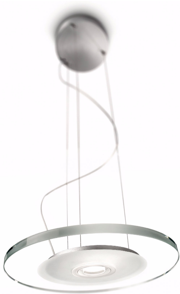
Philips Ledino Suspension light