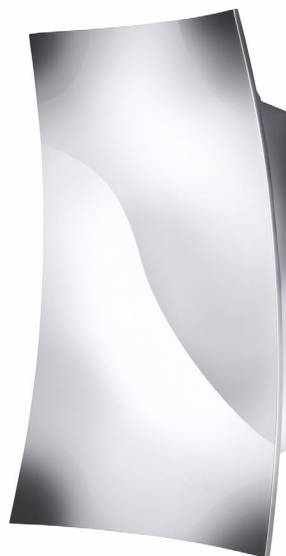
Philips Ledino Wall light