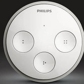
Philips Hue Tap switch