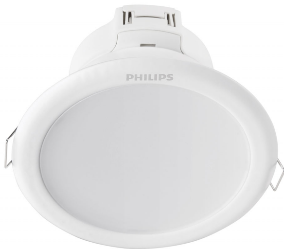
Philips Recessed spot light